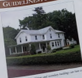
The construction of additions and secondary buildings can have a dramatic impact on the historic setting.

PURPOSE These Guidelines were prepared to assist property owners with information when considering the construction of a new building or an addition to an existing building. They are not intended to replace existing building codes, ordinances, and regulations with qualified architects, engineers, and other professionals. The Historic Preservation Commission (HPC) will be happy to provide consultation and assistance with questions, but not design.