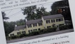
At these addresses you will see the original part of a building.

PURPOSE These Guidelines were prepared to assist property owners with information when considering the construction of a new building or an addition to an existing building. They are not intended to replace existing building codes, ordinances, and regulations with qualified architects, engineers, and other professionals. The Historic Preservation Commission (HPC) will be happy to provide consultation and assistance with questions, but not design.